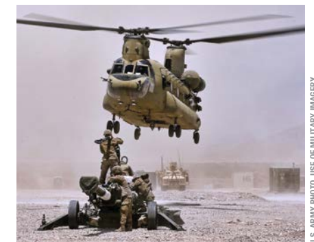
USE OF MILITARY IMAGERY DOES NOT IMPLY OR CONSTITUTE DOD ENDORSEMENT.

Baker College strongly believes in the Principles of Excellence as outlined in Executive Order 13607 by being a participant of the Degree Network System (DNS), DANTES, GoArmyEd, and CCAF's AU-ABC Program. The college is a proud signer of the DOD MOU and is eligible to receive Federal military and Veteran education benefits.